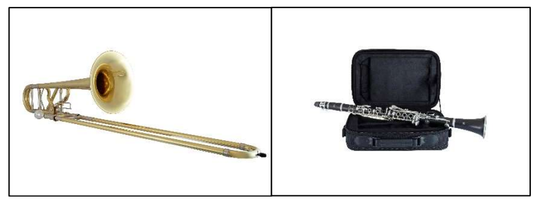
Bach "Artisan" Professional Tenor Trombone and Leblanc "Serenade II" Clarinet from Conn-Selmer

Conn-Selmer's booth will display their new line of fully modular extensions for their Bach Stradivarius Artisan trombone line, as well as new saxophones, trumpets, trombones and clarinets for both students and intermediate players. For Ludwig fans, some never-before-seen novelties will also be showcased.