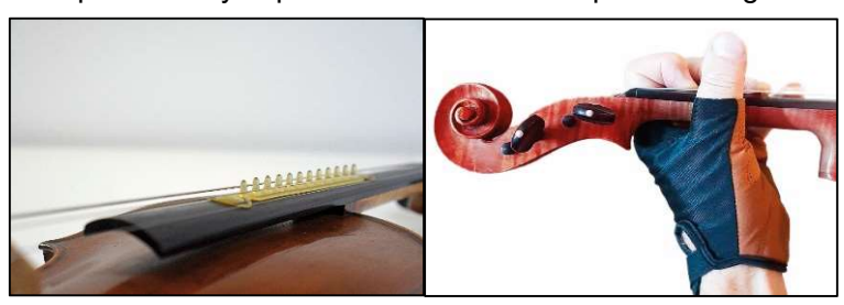
"ResoundingFingerboard" and VioGlove from Petz

company will also promote VioGlove, the first glove in history designed to improve every aspect of left-hand technique for string instruments.